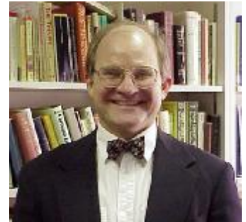
Guest Preacher September 2