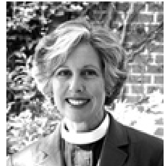
Guest Preacher August 5