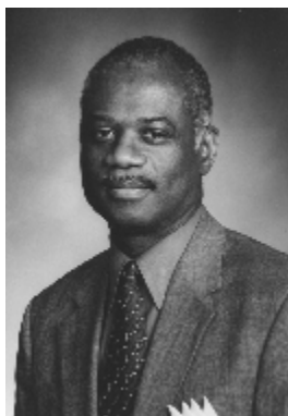
Guest Preacher August 12