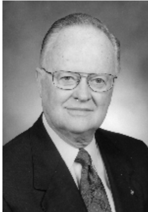
Guest Preacher Sunday, June 10 & 17